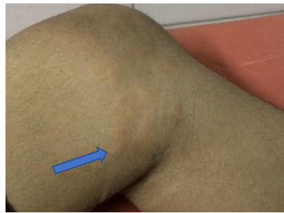
Fig. 4: Planar Xanthomas