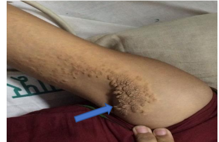
Fig. 5: Eruptive Xanthomas