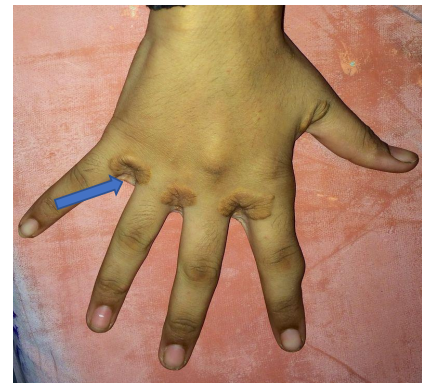
Fig. 6: Intertriginous Xanthomas