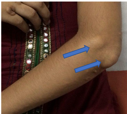
Fig. 2: Tuberos Xanthomas